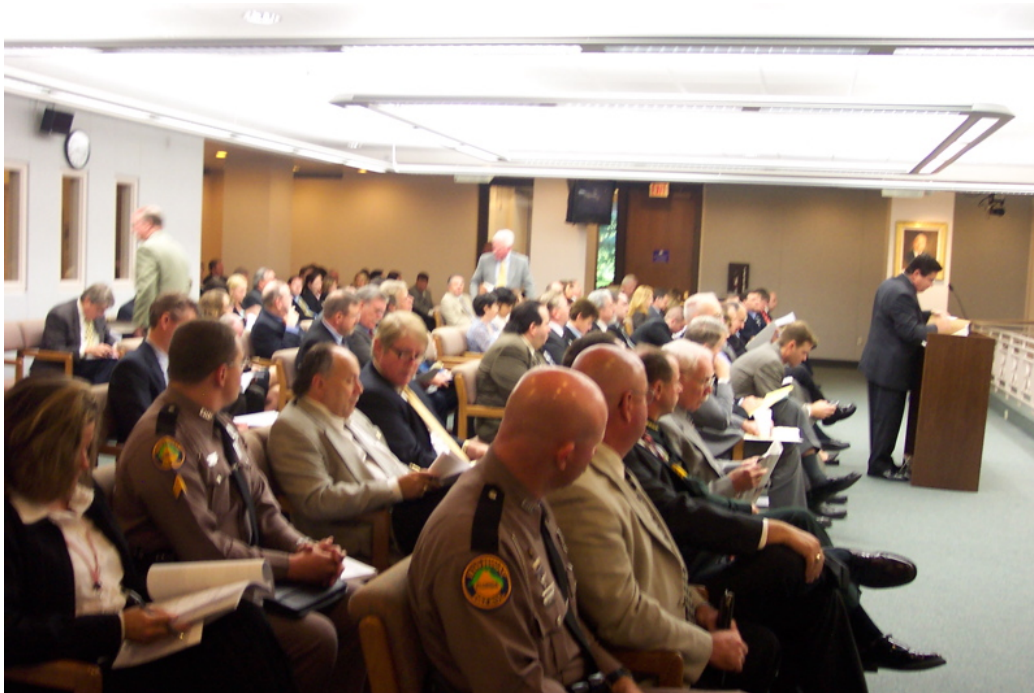
Statewide Chapter Presidents fill the House Safety & Security Council meeting.

On Wednesday, the House Safety & Security Council unveiled the long awaited salary proposal for all State Law Enforcement, Correctional and Correctional Probation Officers. SSC 13 by Representative Will Snyder attempts to provide supplemental salary increases to every officer employed with the state by diverting a portion of a fee charged to probationers. Currently, a $2.00 surcharge for equipment is added to the fees a probationer pays as a condition of probation with the receipts of this surcharge being deposited into a trust fund administered by the Department of Corrections. The proposal would siphon off a portion of that fee into the Criminal Justice Standards & Training Trust Fund for the exclusive purpose of providing supplemental salary enhancements to all state officers.