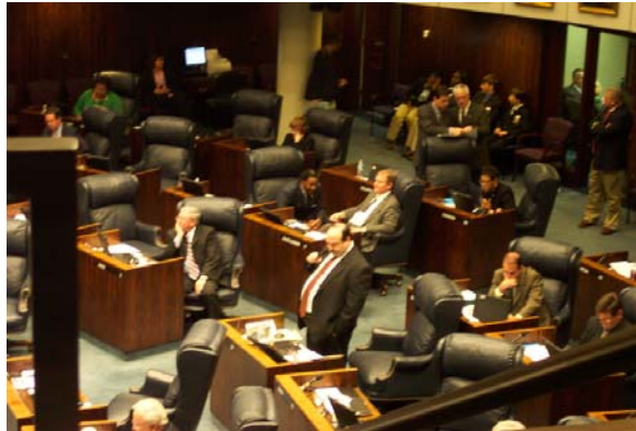
Senator Steven Geller on Senate Floor.

Despite an amendment attempt to stop the cuts to Correctional and Correctional Probation Officers by the Florida PBA, Senate Democrats led by Senator Steven Geller and one Republican, Senator Steve Oelrich , the House and Senate budgets were approved this week with the cuts intact. The next step in the process is the appointment of conference committee members to work on the budget differences between the two chambers. Conference is where the rubber meets the road. If these cuts remain in the appropriations bill after conference is complete... officers will be laid off.