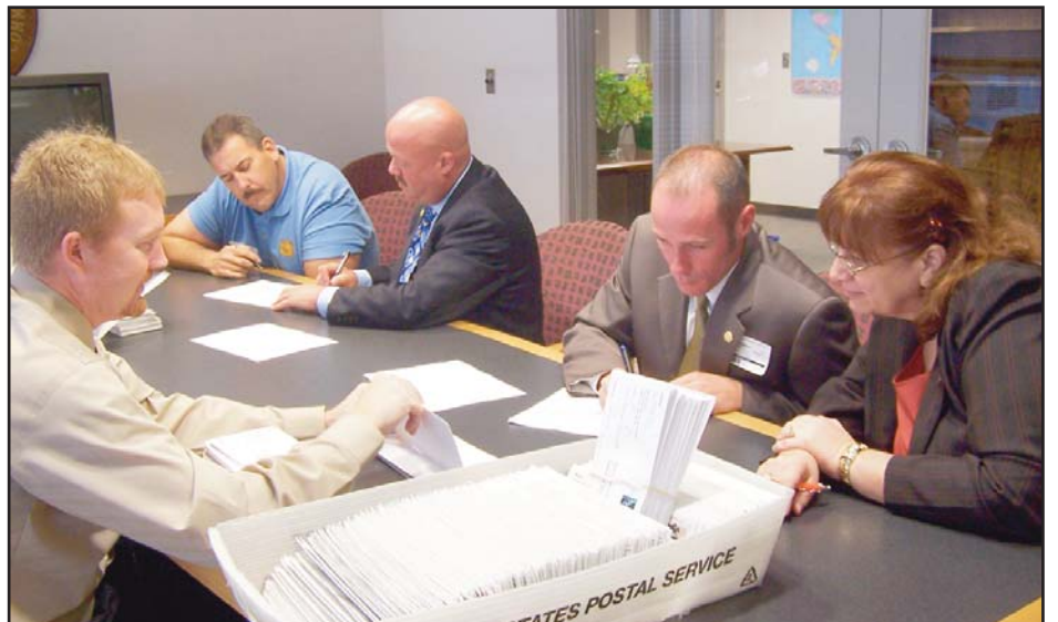
The hard working folks at PERC and Broward County PBA officers going over the vote count where Broward County PBA defeated IUPA.