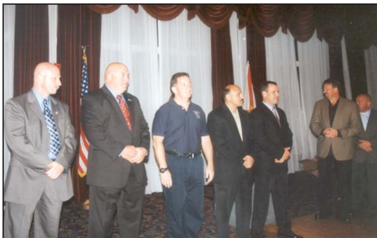
Some of the Charter and Chapter Presidents at the ceremony.