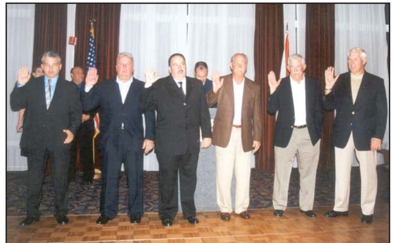
The Florida PBA Executive Committee at the swearing in ceremony.