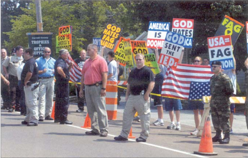
Sometimes it's hard to understand where all the anger comes from, but regardless of people's beliefs, the funeral of a fallen soldier is no place to grand-stand for your cause.