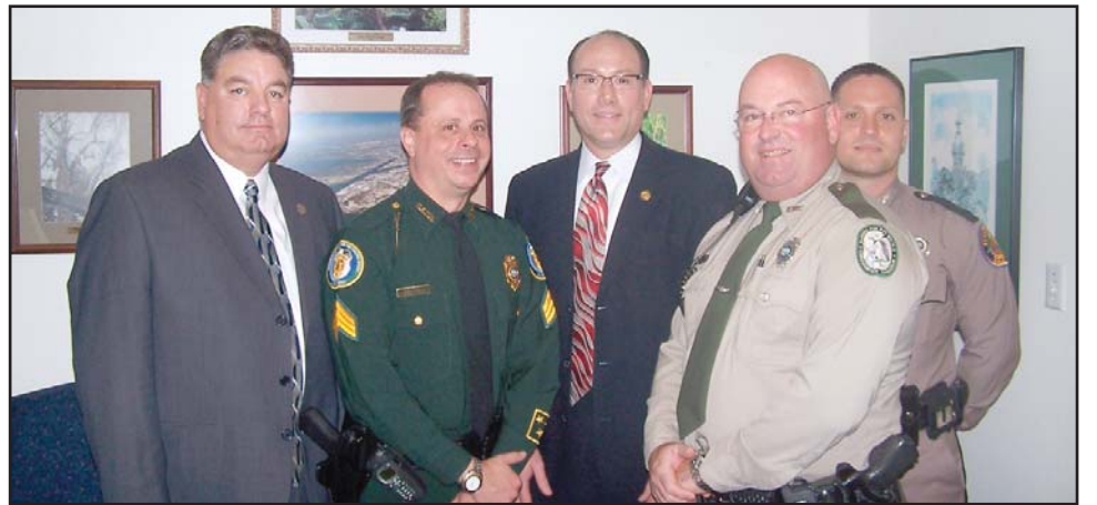
Senator Victor Crist with SLEO and FHP Chapters.